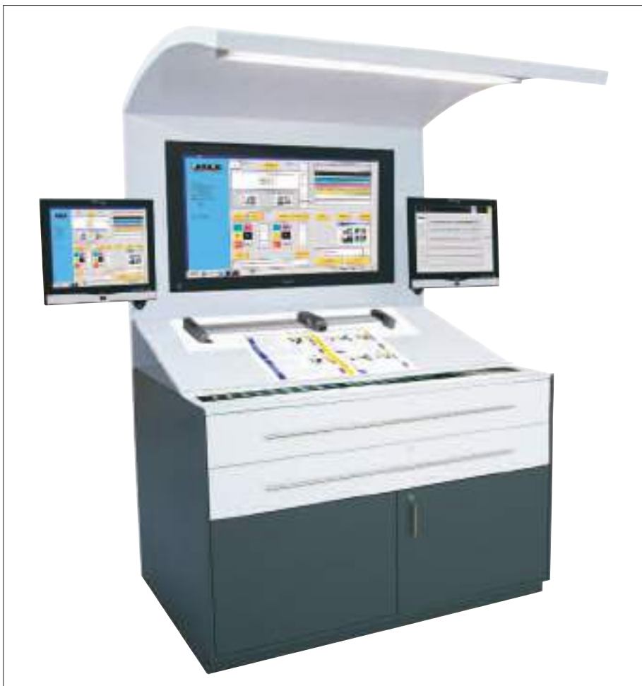
InkZone Loop is compatible with almost all press consoles.

So, once the operator checks the color results and the recommended press adjustments, at the touch of a button the ink keys for all printing units can be adjusted automatically. This can lead to results that are clear: a significant reduction in makeready and run waste, higher overall color quality, and consistent, stable production runs.