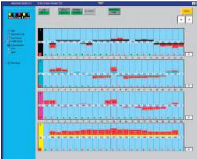
Input: See all ink values in all zones at a glance.