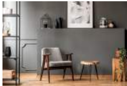
DMB Ink Savings: 37%