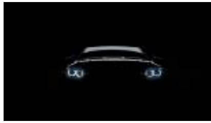
DMB Ink Savings: 27%