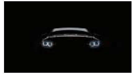
MTIU Ink Savings: 44%