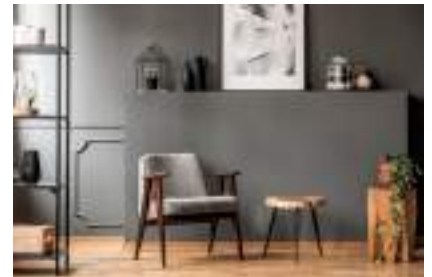
MTIU Ink Savings: 44%